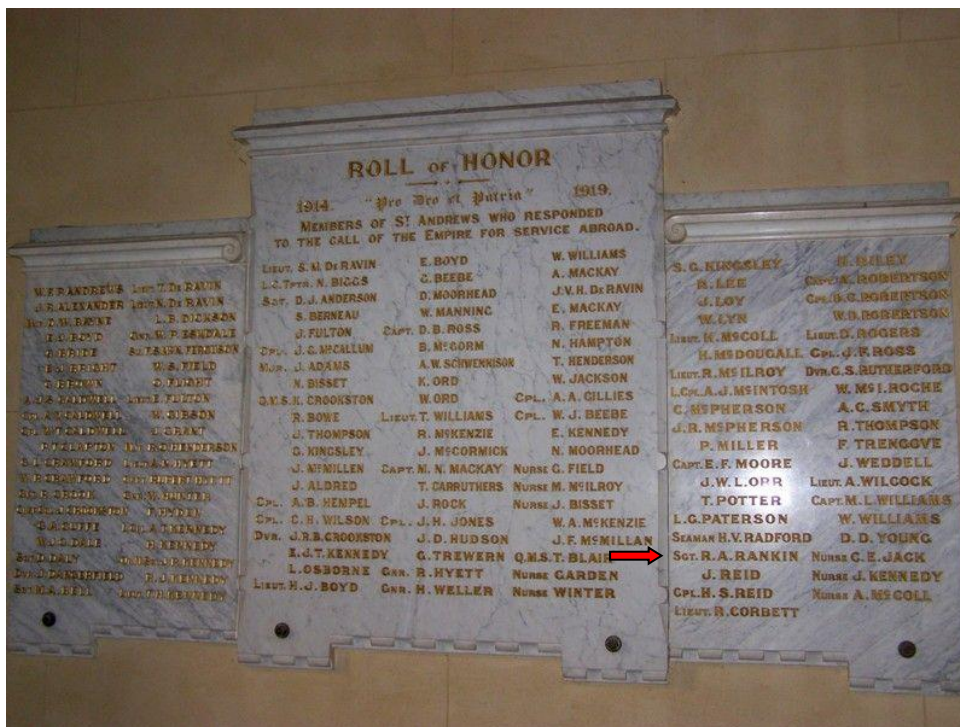
St Andrew's Presbyterian Church Roll of Honour