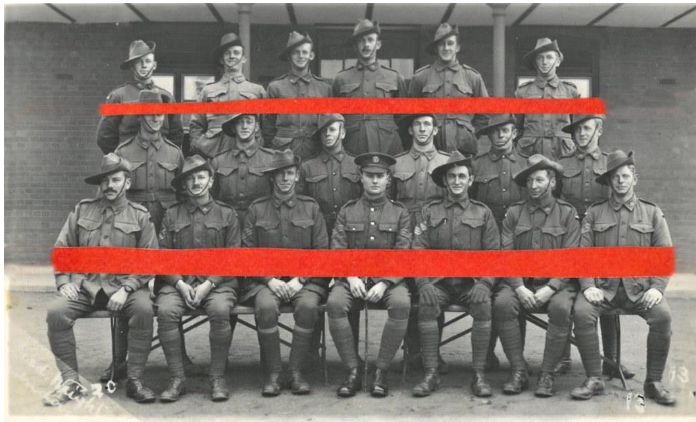
No. 13 Squad of Australian soldiers at Jellalabad Barracks, Tidworth, England - March 1918

Information obtained from the CWGC, Australian War Memorial (Roll of Honour, First World War Embarkation Roll, Red Cross Wounded & Missing) & National Archives