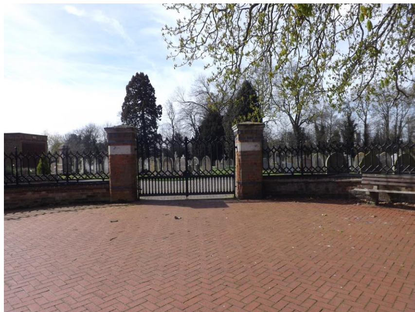
St. Neots Cemetery