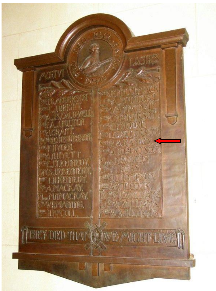
St Andrew's Presbyterian Church Roll of Honour – Those who Died