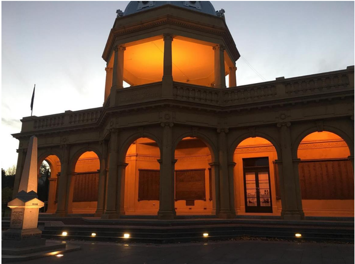
Soldiers' Memorial Institute, Bendigo